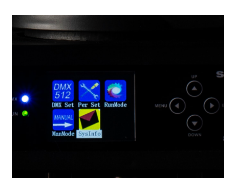
FULL COLOR DISPLAY MENU