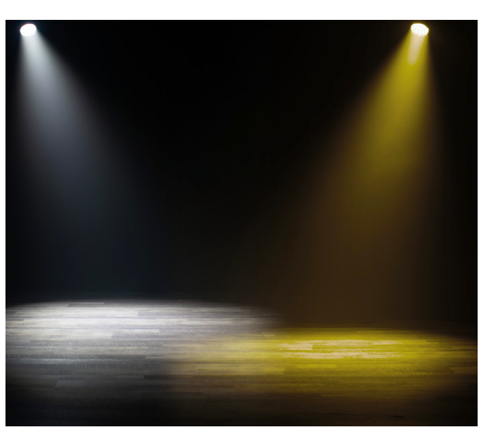
WHITE COLOR TEMPERATURE CONTROL: 3200-10,000K