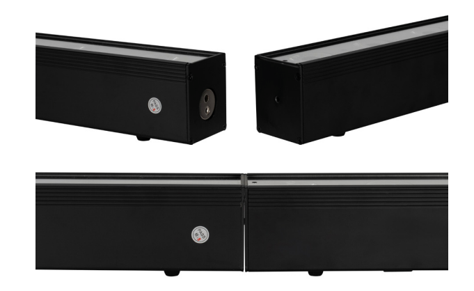
Horizontal Magnetic Alignment feature to lock fixtures together for seemless color output