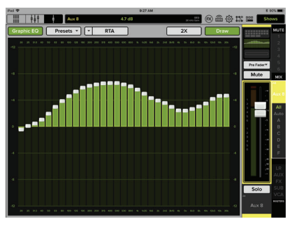
CHANNEL EQ. EFFECTS OUTPUT GEQ + RTA